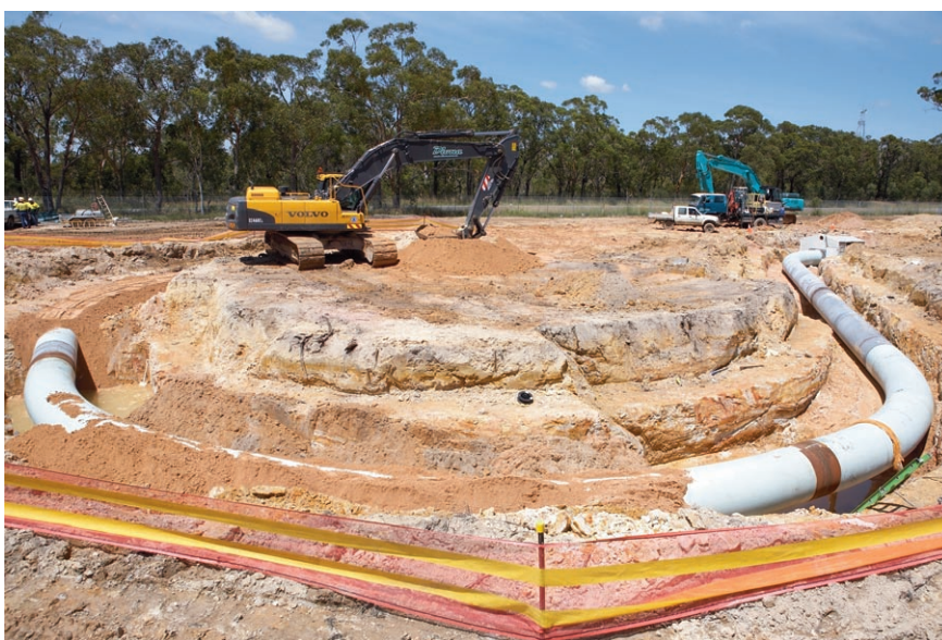
Figure 3. The Colongra Pipeline loops back on itself to increase the length of the pipeline by 3 km, and hence storage capacity, but also added to the precision welding requirements.

turbine generation is comparatively responsive, taking just hours.