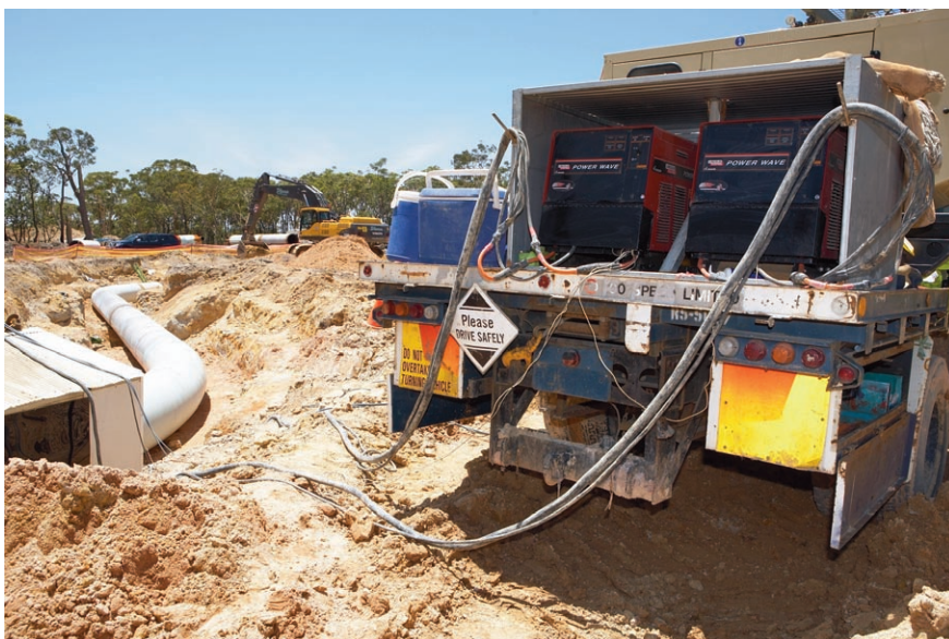
Figure 5. The Lincoln Electric® Power Wave® 455M machines completed the STT® root runs using a semi-automatic process, followed with G70M semi-automatic hot pass before fillout.

The pipe is also unique in that it loops back on itself to increase the length of the pipeline by 3 km, and hence storage capacity. Jemena had a specialised pipe bending machine built in the US for the project and this looping of the pipe added to the precision welding requirements.