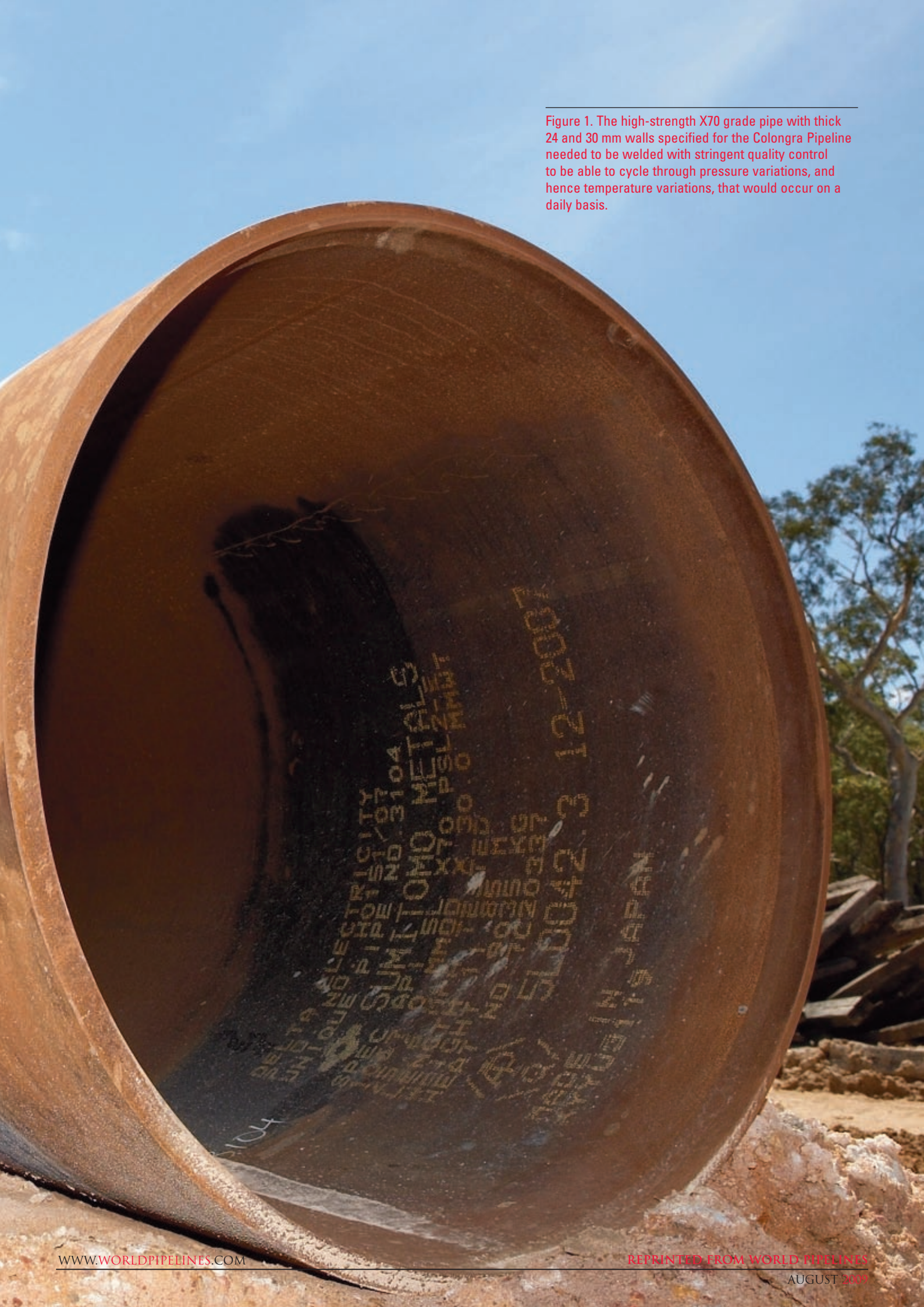
Figure 1. The high-strength X70 grade pipe with thick 24 and 30 mm walls specified for the Colongra Pipeline needed to be welded with stringent quality control to be able to cycle through pressure variations, and hence temperature variations, that would occur on a daily basis.