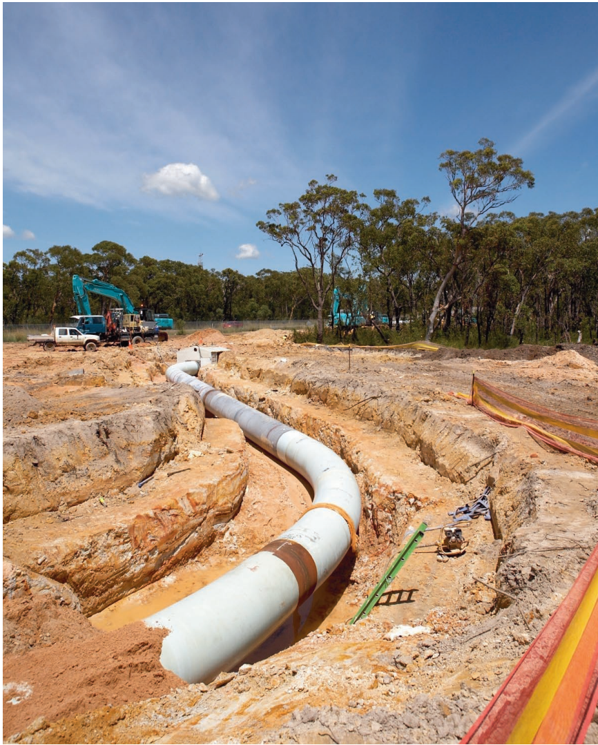
Figure 2. TOFD (Time of Flight Diffraction) ultrasonic testing was used as the inspection method. This has a much higher defect detectability rate than radiography.