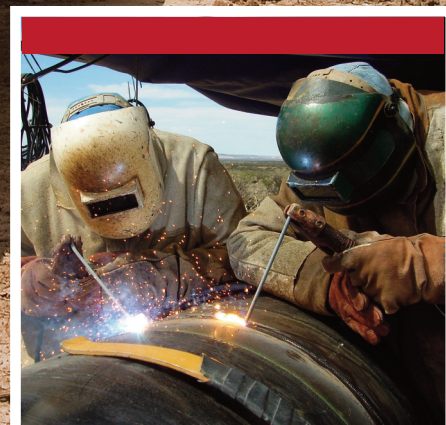
PIPELINER ® LH-D STICK ELECTRODE

High productivity, low diffusible hydrogen levels and increased operator appeal make the new Pipeliner ® LH-D electrodes the right choice for your next pipeline welding project.