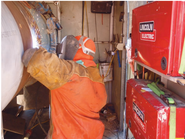
Figure 6. The dual wire feeder capabilities of the Lincoln Electric® Power Wave®/STT® power source also enabled efficient switching between processes.

The author, Steve Hudson is Technical Sales Representative, Southeast Region, The Lincoln Electric Company (Australia).