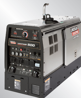
VANTAGE ® 500 ENGINE DRIVEN WELDER

www.lincolnelectric.com pipeline@lincolnelectric.com