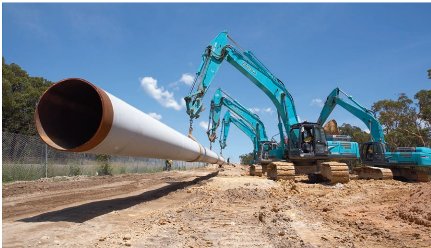
Figure 4. Once the sections of pipe were laid with precision, the hut is placed over each weld section, the truck with generator and STT®/Power Wave® machines moved into position and connected all done within a 20 minute time frame.